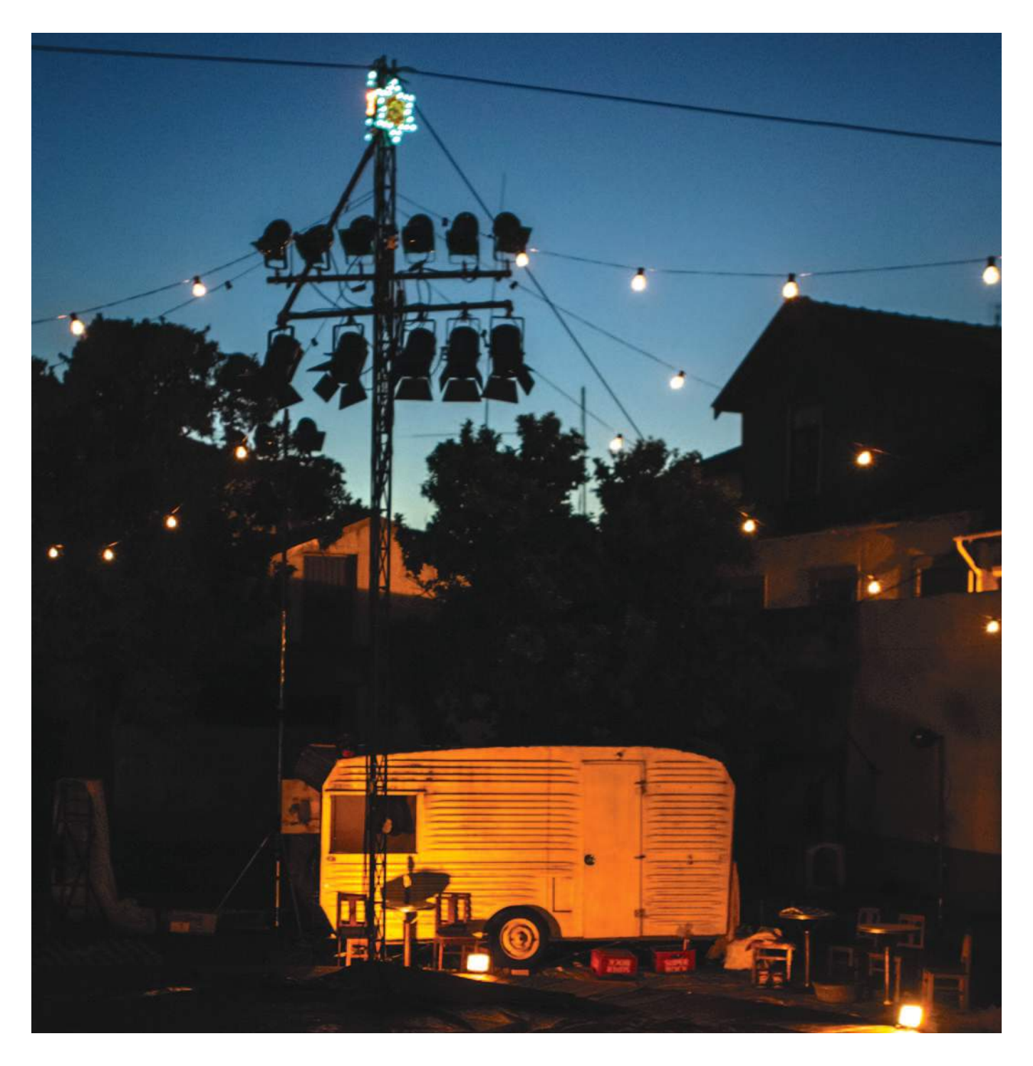
Festivities urge to be reinvented. Because whenever festivities were dissolved and confused in the triviality of days and works, men became sick and lost enthusiasm. Fragile and brief is the festivity.